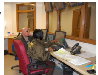
Deputies man new control room

Many working in court services say they want to thank the Sheriff and county officials who vigorously moved this project along.