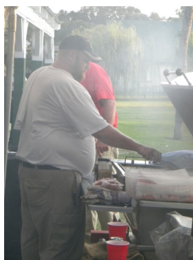
Above: Secretaries line up for some home cooking.

More than a hundred secretaries and administrative assistants from sheriff's offices all over the state spent several days in Savannah in September as part of the Georgia Sheriff's Association's annual conference.