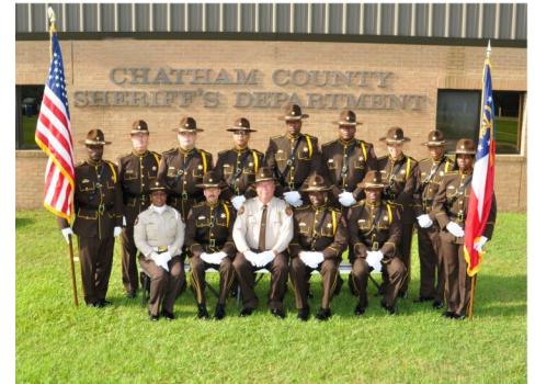
The are 19 deputies assigned to the Honor Guard unit.

The Honor Guard uniforms are in the Marine Corps high-collar design. They have several variations of uni-